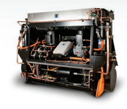
For use on standard diesel engine-driven buses.