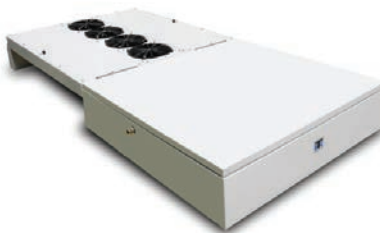
RLF-E and RLF EA Series