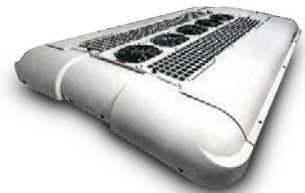
ATHENIA E-800 & ATHENIA EA-800